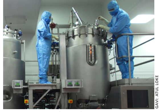
The availability of IFFIm funds supports security of vaccine supply.

Medium-term funding remains a challenge with US$355 million required for activities in 2008. Other donors must now follow the lead of IFFIm and move quickly to ensure funding to protect recent gains and to stop polio transmission everywhere.