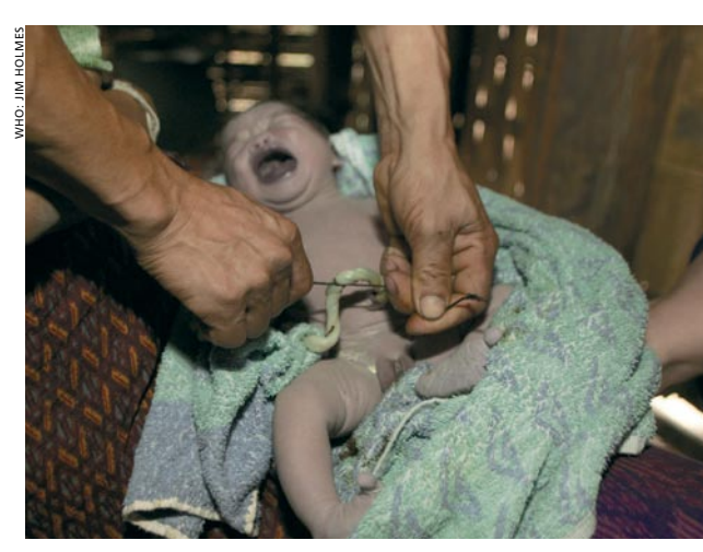
This picture was taken in Laos, at a home delivery, with no skilled birth attendant. The umbilical cord is being cut by the father with a sliver of bamboo.

On the principle of early, robust action, US$139 million of IFFIm support went to the Measles Initiative by June 2007 (full disbursement).