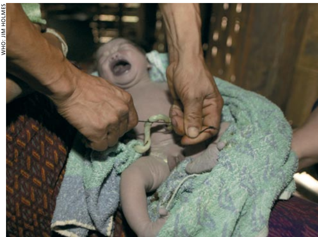
This picture was taken in Laos, at a home delivery, with no skilled birth attendant. The umbilical cord is being cut by the father with a sliver of bamboo.

On the principle of early, robust action, US$ 139 million of IFFIm support went to the Measles Initiative by June 2007 (full disbursement).