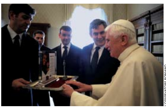
Pope Benedict XVI receives the IFFIm gift from British Prime Minister Gordon Brown

Baby Brucktayet had just received a pentavalent vaccination against diphtheria, pertussis, tetanus, Hepatitis B and Haemophilus influenzae type B or Hib provided by the GAVI Alliance using funds raised by IFFIm.